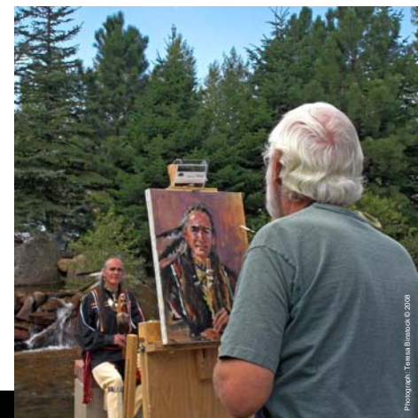
EPPA Quick Draw in Riverside Plaza Opening Day in Estes Park, Colorado